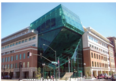
San Joaquin County