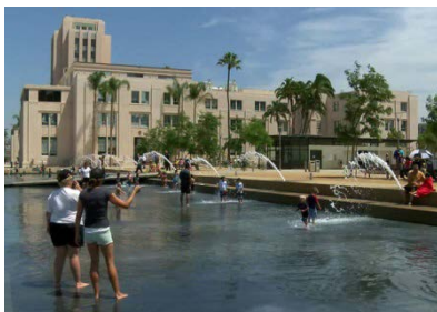
San Diego County

The reader should keep in mind that specific office descriptions vary by county and are subject to change based on statutory mandates and funding availability.