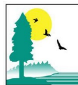
CALIFORNIA STATE LANDS COMMISSION

million acres of state-owned lands including tide and submerged lands, swamp and overflow lands, the beds of navigable waterways, and vacant state school lands.